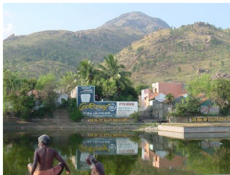
A sadu sits at the water tank in front of Arunachala

A 3% surcharge will apply to all transactions using MasterCard or Visa